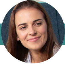
GWEN: software engineer taking notes in a meeting